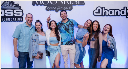
Moonrise raises critical funds in support of Handy Cares.