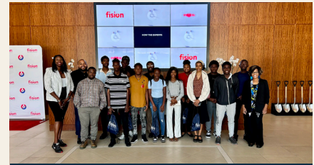
Career Exposure Events