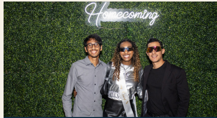
Handy's Annual Homecoming supports of Handy's Education Program.