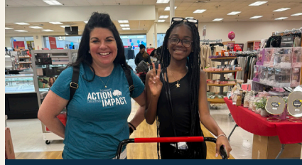
Back to School Shopping