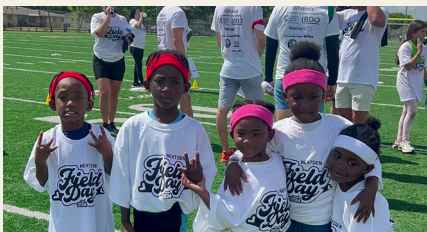
Handy Field Day is a fun-filled day of games, resources, food, and engaging activities for all.