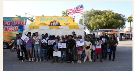
Field Trips & Fun!