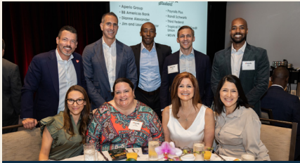
More than 500 community leaders came together for the 20th Anniversary Scholars Breakfast.